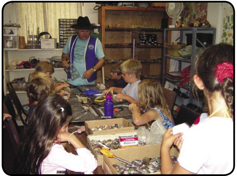
Children enjoy making jewelry at the lapidary school in Lowden Park.