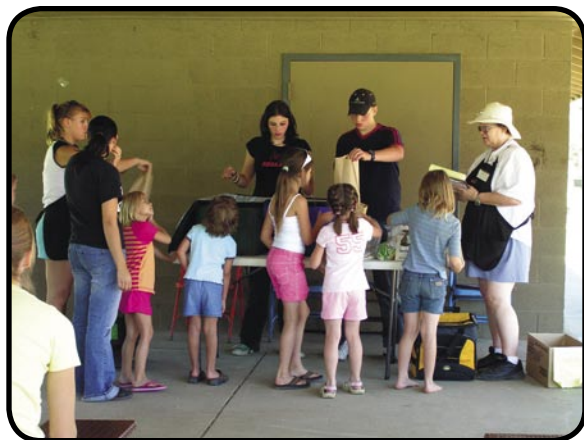
Summer day campers enjoy a free lunch provided by the Trinity Union High School District.